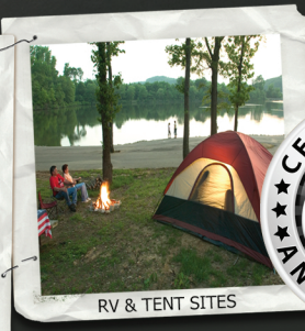
RV & TENT SITES